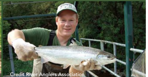
Credit River Anglers Association

Many conservation-minded individuals and organizations are working together to restore wild populations of Atlantic salmon to Lake Ontario.